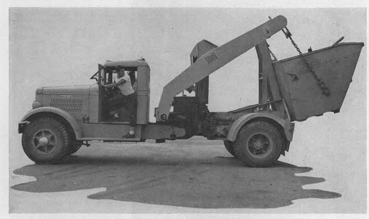
THE DEMPSTER DUMPSTER hoists one of the away. Here Charlie A. Monroe, 4215, checks to see huge trash buckets spotted throughout the area onto that the big bucket is being hoisted properly. its back and trundles off to dump them five miles

Without the machinery to lift and haul heavy equipment, modern industry could not exist. The highest praise belongs to the men who design, build and operate the machines pictured here.